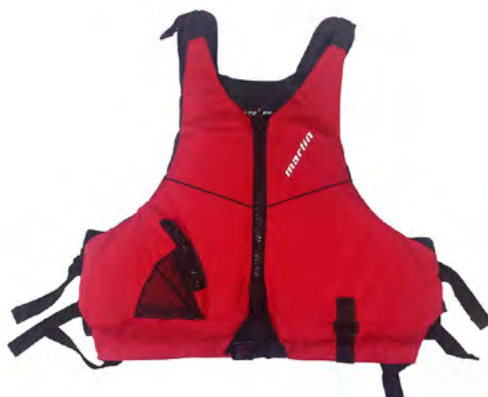
Level 50 • MULTIFIT