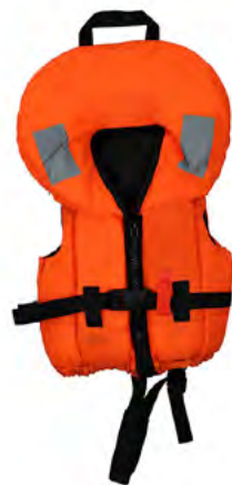
SV100/Level 100 • XS/Small CHILD