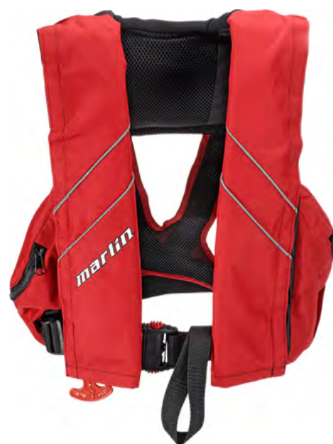
X - FACTOR LEVEL 150