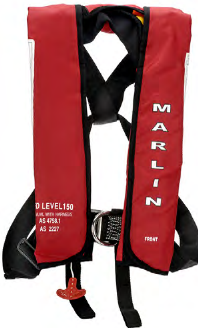
MYAH LEVEL 150N