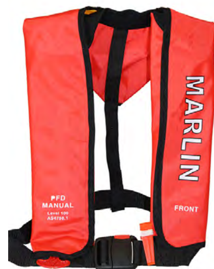
EXP-20M LEVEL 100