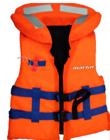
Level 150 • XS/Small Adult • M/Large Adult • XL/XXL Adult