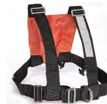
Marlin Safety Harness MH1