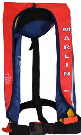
EXP-1MA-J4758 LEVEL 150N