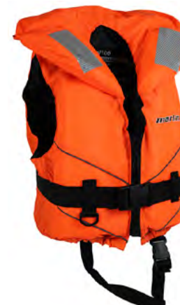
SV100/Level 100 • XL/XXL CHILD