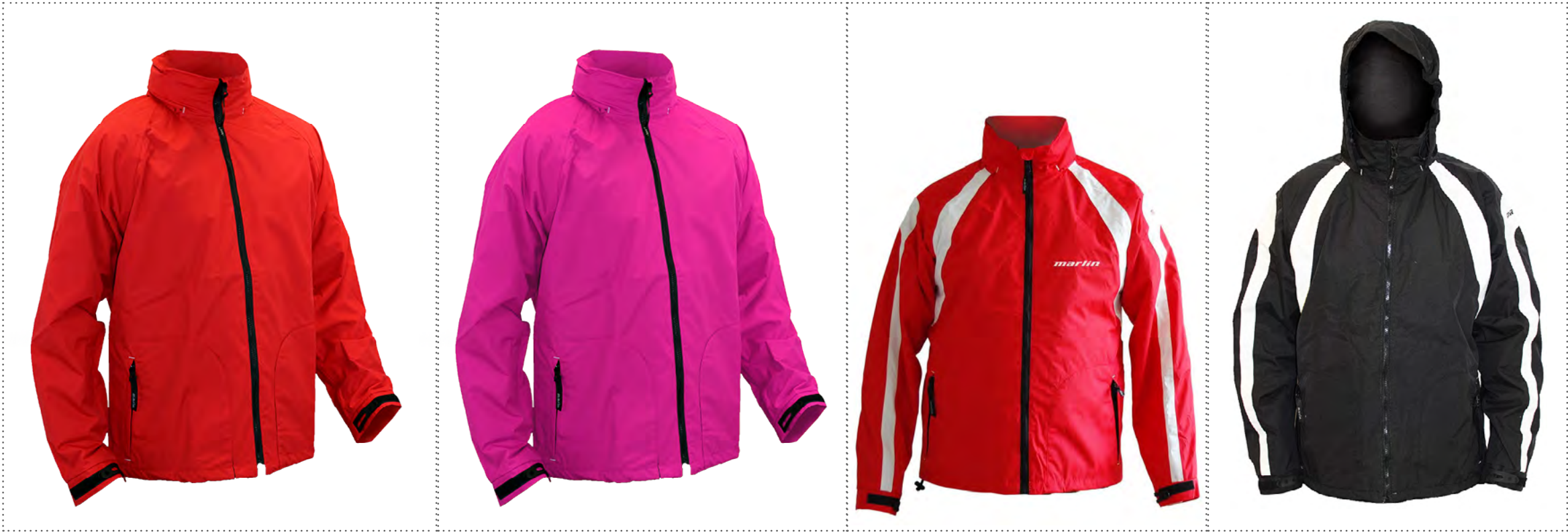
All Purpose Jacket Red