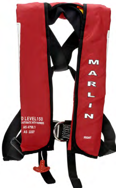
MAYAH LEVEL 150N