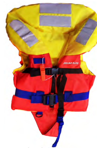
Level 150 • XSmall Child • Small Child • Medium Child