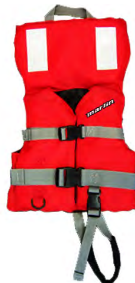
Level 100/ CHILD