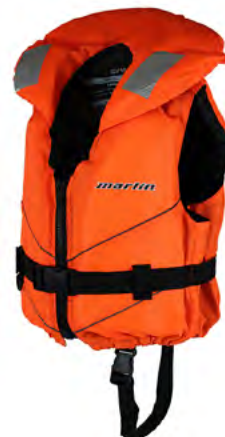
SV100/Level 100 • M/Large CHILD