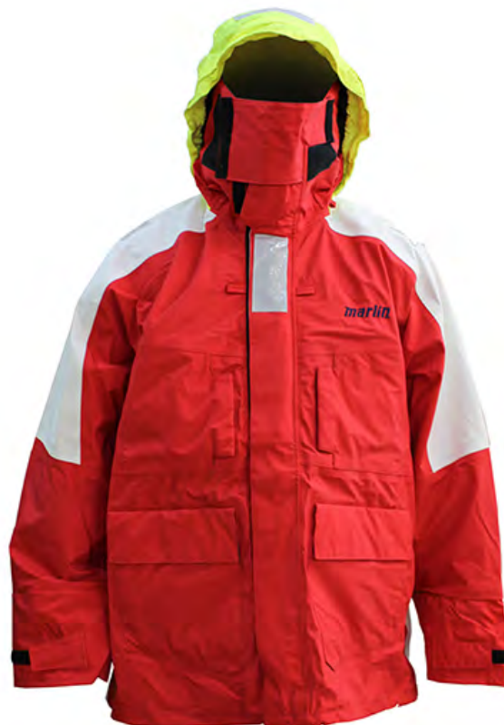
Marlin / Racer Jacket