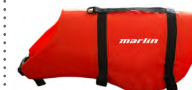
MARLIN DOG VEST SMALL/ DV-S-R MEDIUM/ DV-M-R LARGE/ DV-L-R XLARGE/ DV-XL-R