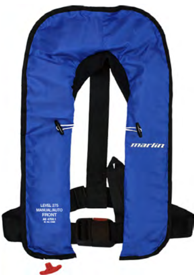
EXP-280MA LEVEL 275N