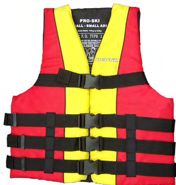
PRO SKI JACKET