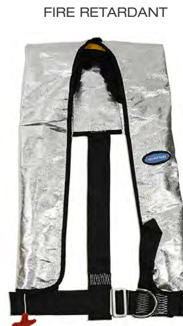
EXP-1MASFRD LEVEL 150