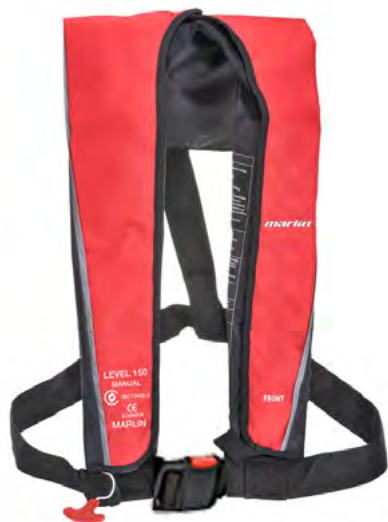
EXP1M Level 150