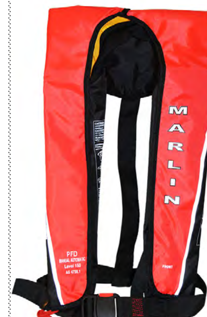
EXP-1MA LEVEL 150